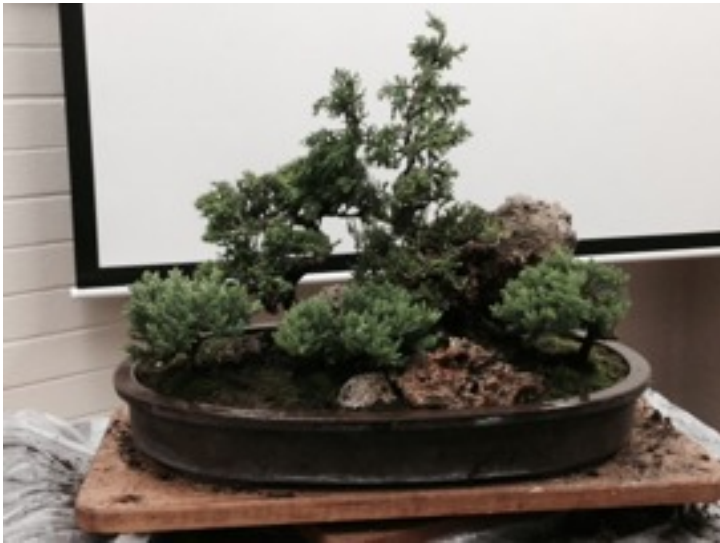
Finished Saikei. Beautiful, Ken!