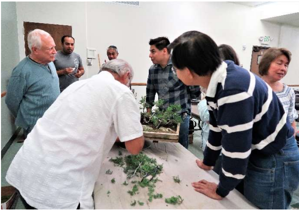
The raft after the trim is finished.